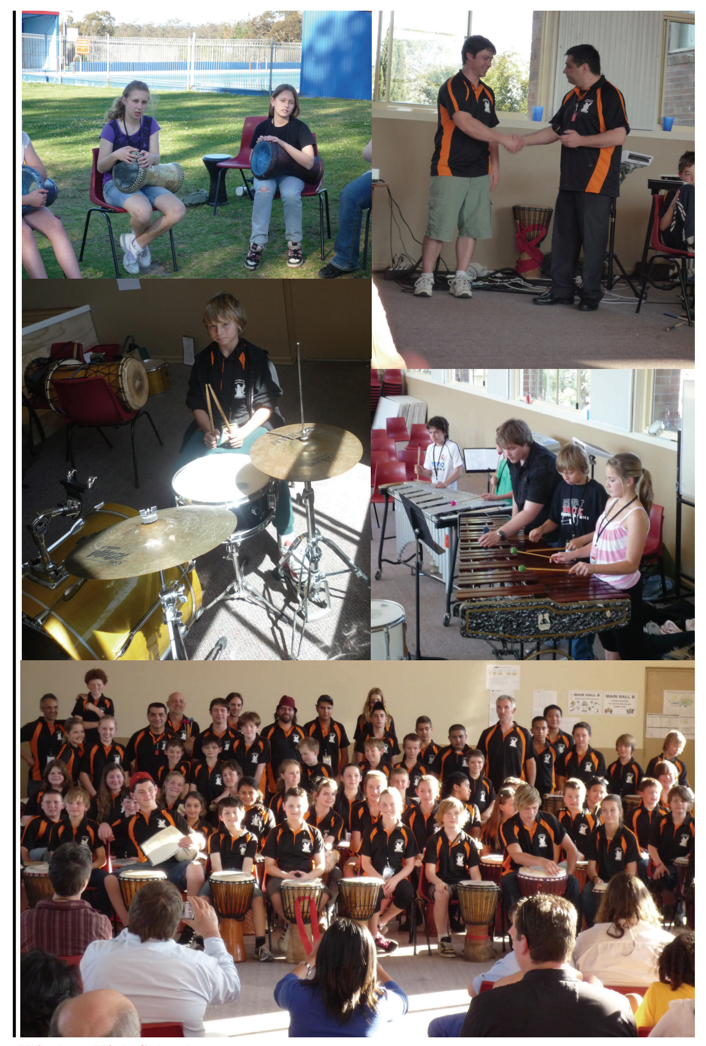
Windsor High School