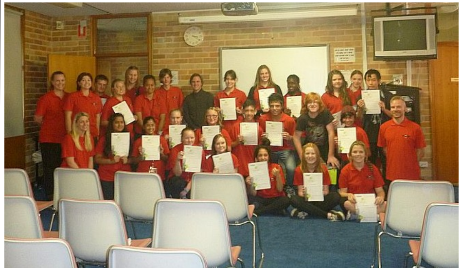
Windsor High World of Work Program participants - See Page 8 for full report.