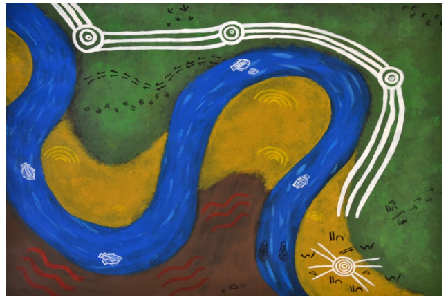
Painting by Carly Fraser-Jones

Category 2 : A design for a mural that tells