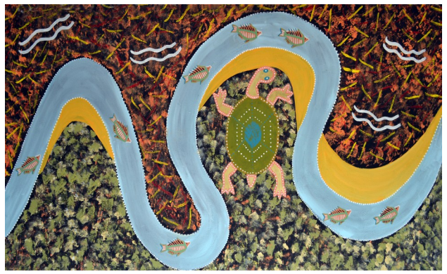
Mural by Yr 10 Students