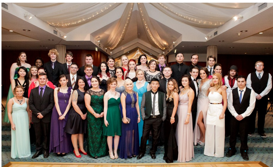
YEAR 12 STUDENTS AT THEIR FORMAL 2014