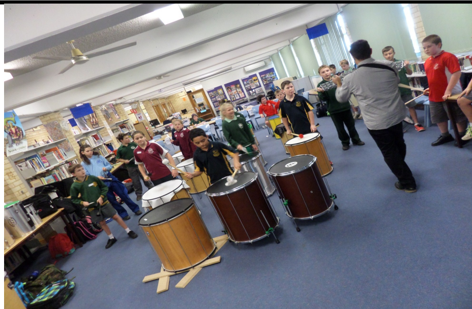
Hawkesbury Enrichment Program