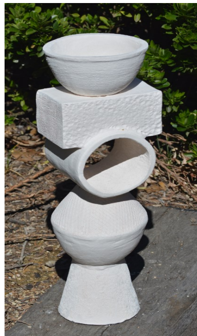
Sarah Yr. 11—totemic form view 2