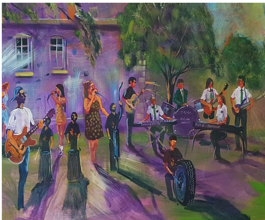
Blues and Roots Artwork of the Windsor High Band—2017—Artist Unknown