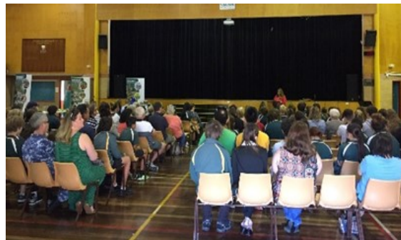
Year 7 award recipients.