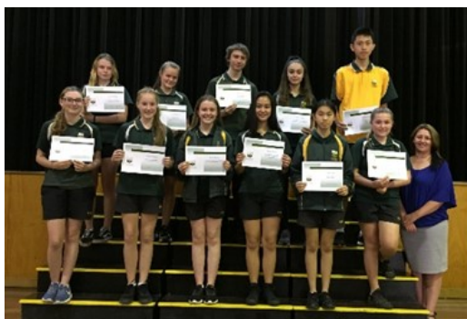
Year 10 award recipients.