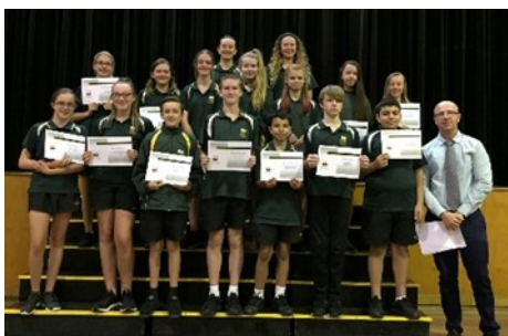
Year 8 award recipients.