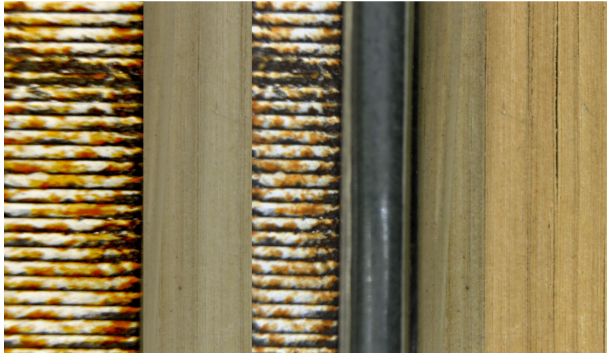
Photographic Texture Study—Clarice—Year 9