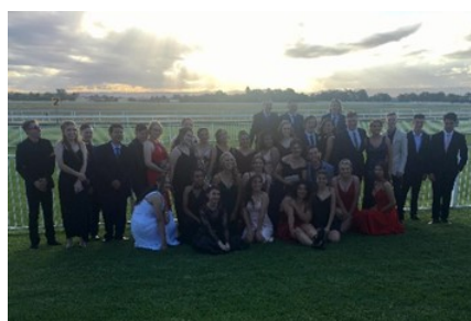
Year 10 Formal