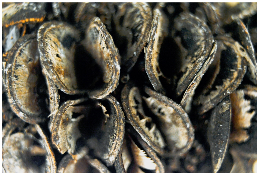
Banksia Study—Year 9 Photography