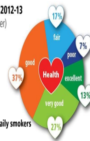
Percentage of daily smokers (15 years and over)