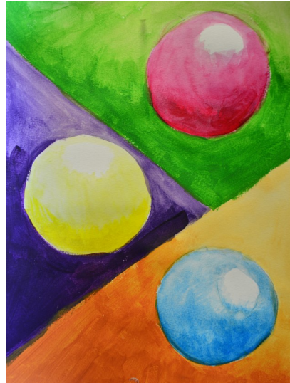
Complimentary Colours and Form—Yr 7 Sample.