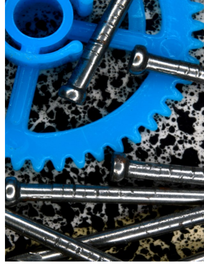
Macro Composition—Found Objects—Year 9