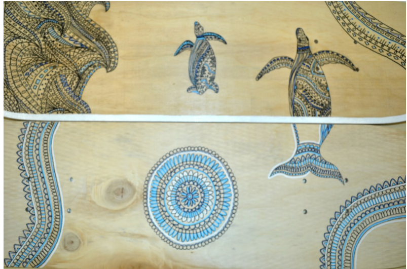
Skateboard Deck Designs—Year 8