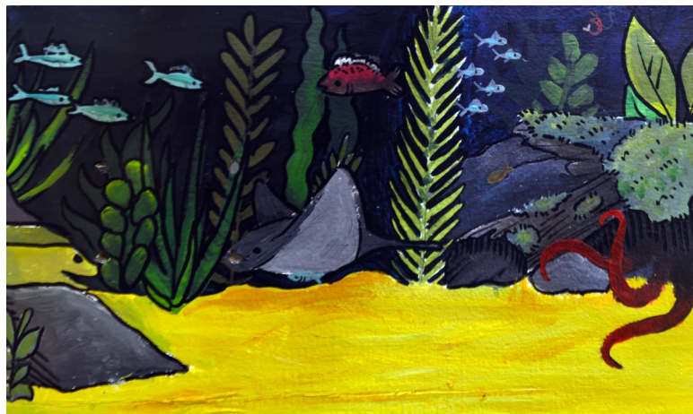
Undersea Skateboard Deck—Taylor Year 8