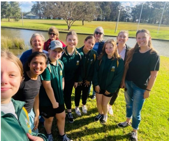
Group photo after one of our sessions at McQuade Park