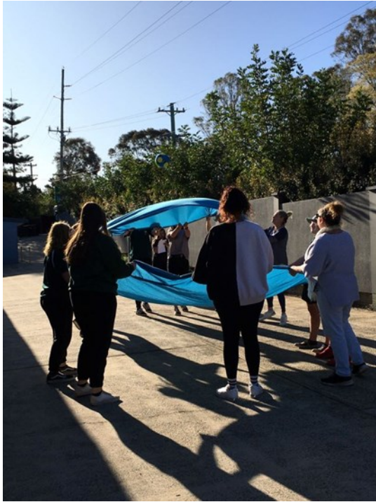
Spending time at One80TC, was one of our highlights. Here we are playing “blanket volleyball”.