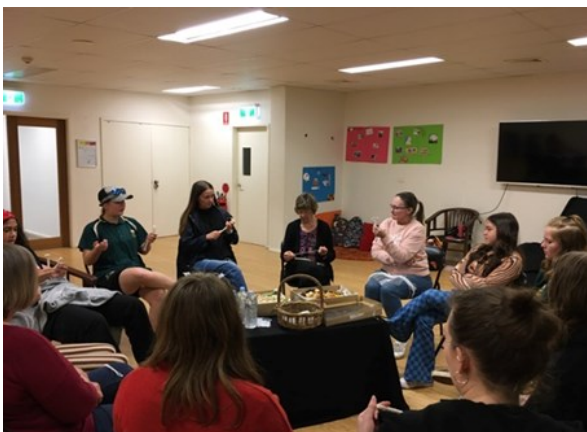
Group discussion on the importance of building healthy relationships