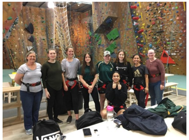
We had a lot of fun rock climbing and encouraged each other to give it our best.