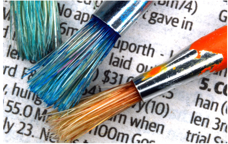
Macro Composition—Molly—Year 9