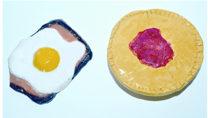
Pop Art Food—Year 7 2021