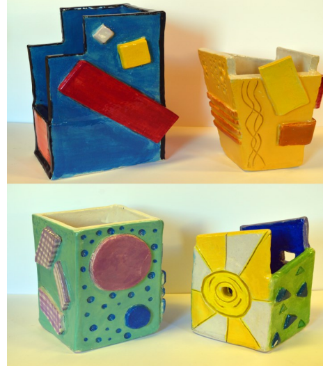
Slab Build Ceramic Vessels—Year 9