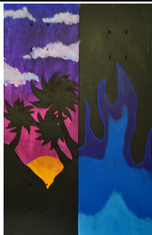
Skateboard Decks—Ash & Indy